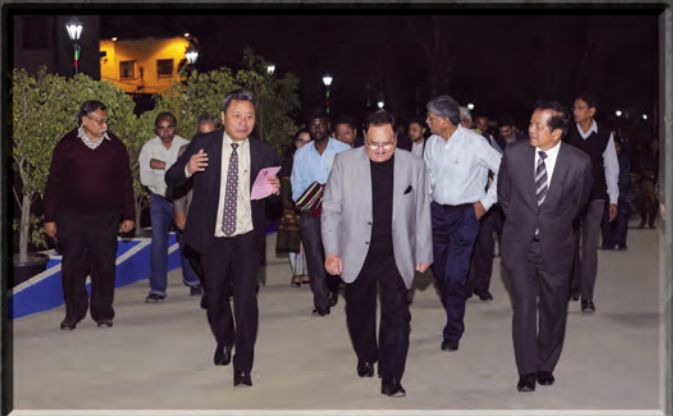
9 th BOG Meeting, 20 th January, 2018 at Conference Hall, RIPANS, Aizawl