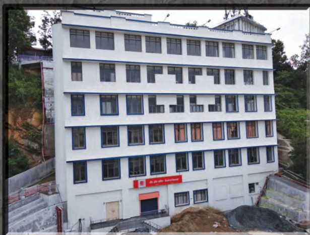
Library cum Examination Hall